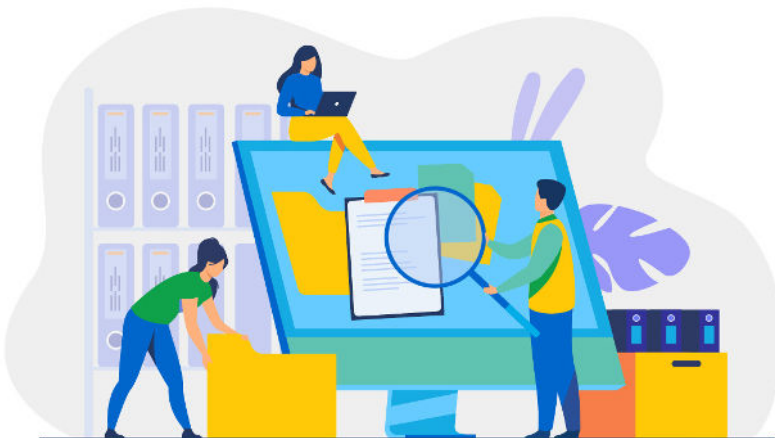
IMAGE RETRIEVAL IMAGE PROCESSING FORMS PROCESSING SCANNING BARCODING IMPORT CONVERSION TO PDF DIGITAL SIGNATURE OCR CONTROL OF LOCAL DEVICES

Update existing applications with new functionalities without leaving a well-known application from the same interface, launch a number of additional features: